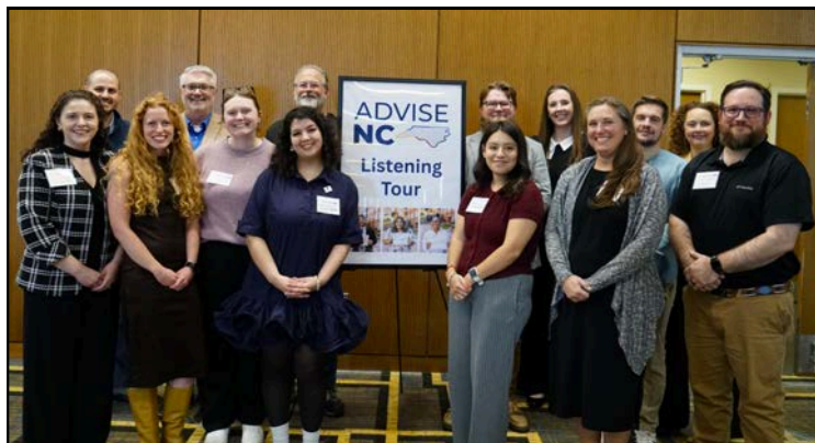
The Advise NC at App State team pose for a photo at the Oct. 28 listening tour.