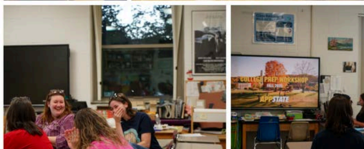
Snapshots from the "Countdown to College Week" family night.