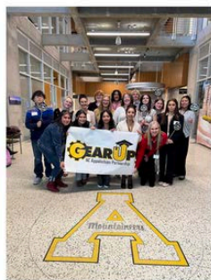
Students in App State's GEAR UP LEADERSHIP.

Leveraging new and existing grant-supported programs, the Office of Rural Promise builds strategic partnerships to solve big challenges in rural communities; designs and implements