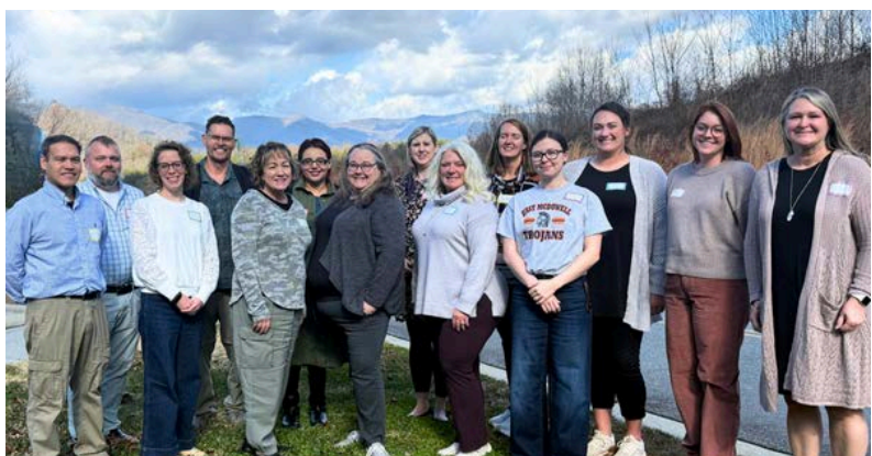
The first cohort of Western North Carolina Research Fellows pose for a photo at the Nov. 19 kickoff event.