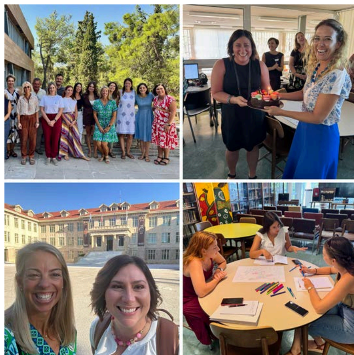
Snapshots from Greece.

The content of these micro-credentials directly addresses extensive feedback received over the past four years from ETL and GREAT STEM participants. Educators requested more focused credentials, specifically in STEM and content areas. As a result, the new offerings focus on high-demand subjects, including math, science, Exceptional Children, and outdoor learning. By utilizing teacher feedback as the foundation for the credentials, the training is guaranteed to align with current educational needs.