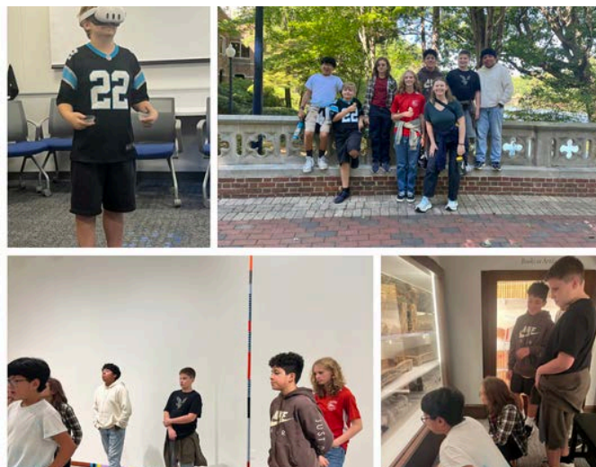
YES Students spent two days in Richmond, VA, exploring the University of Richmond and the Visual Arts Center.