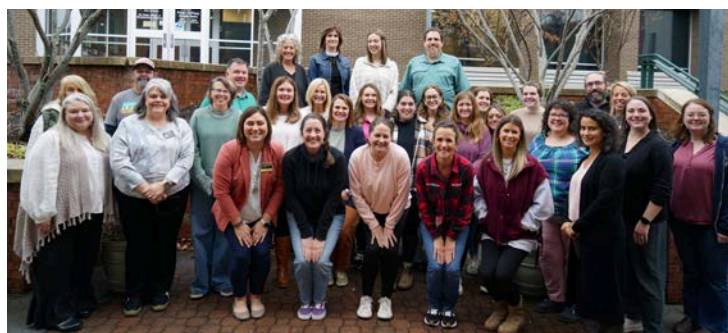
Participants in the Remote Learning Workshop pose for a photo at Appalachian State University.