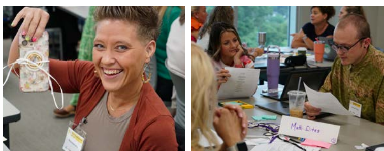
Snapshots from the RTLN West kickoff event.