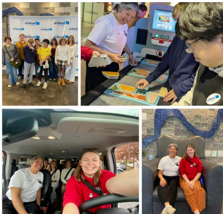
YES Students explore the Catawba Science Center to celebrate the end of the fall semester after-school program.