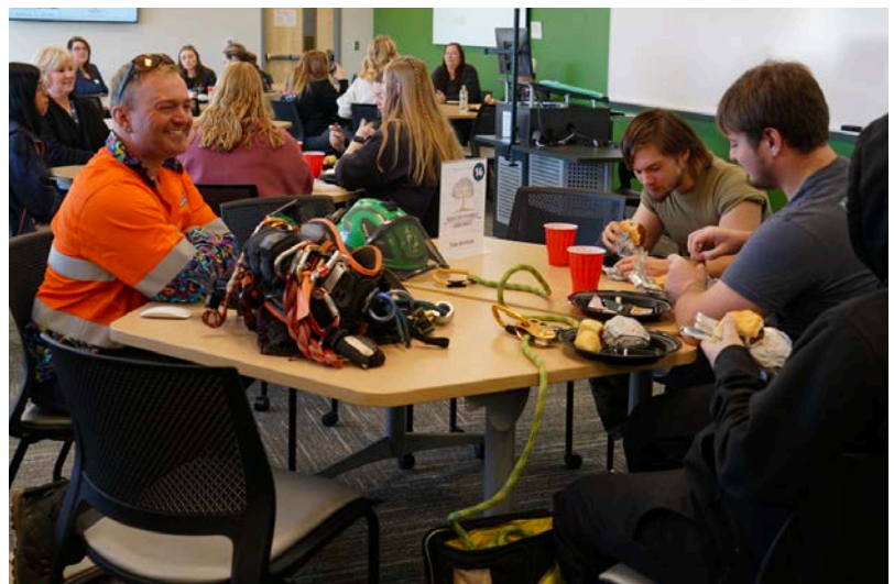
Students at ACHS interact with workforce breakfast guests. GEAR UP staff was also present at the event.