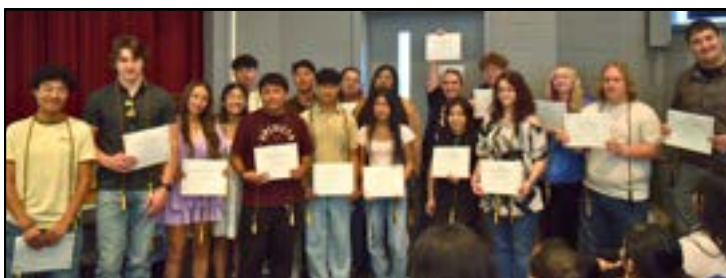
Upward Bound class of 2025

These students are headed off to so many incredible colleges across North Carolina. We are proud of their persistence, their drive, and their motivation to move into this next chapter of their lives. Congrats, Class of 2025!