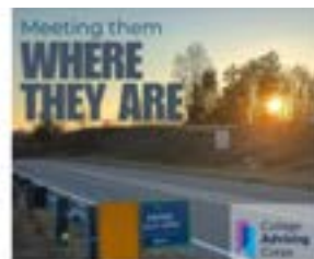
College Adviser Meets Students Where They Are Apr 9, 2025

On September 24, 2024, Hurricane Helene made landfall in Ashe County, North Carolina.