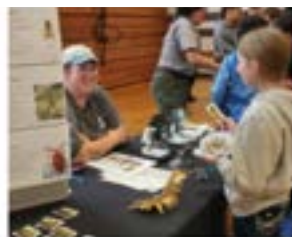
2025 Swain County STEAM Expo Apr 28, 2025

On Thursday, April 24, the STEAM Expo took place at Swain Middle School for the second year in a row.