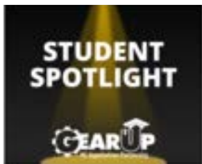
GEAR UP Alumni Spotlight: Peyton Cline May 14, 2025

Peyton Cline always knew that she was going to attend college.