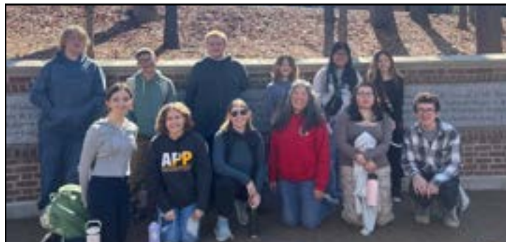
YES Scholars tour University of Richmond