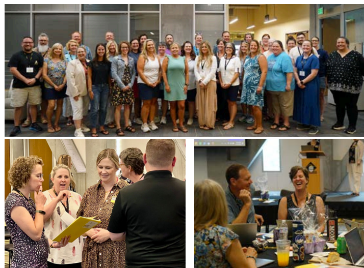
ETL Summer Convening

From July 29th–August 1st, the ETL team hosted a four-day series of professional learning events at Appalachian State University, bringing together teachers from across the Empowering Teacher Learning community. The week kicked off with the Innovation Cohort, where 38 veteran ETL teachers explored ways to introduce more autonomous and self-directed learning opportunities into their classrooms this year. This group will meet twice throughout the year and work in community groups and alongside their Navigator on developing unit plans that embrace student self-directed learning with the hope of developing the leaders who might implement ETL on their own campuses.