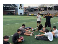
Snapshots from Upward Bound Summer Academy