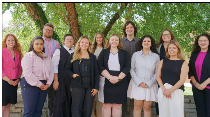
Advise NC at App State team poses during recent summer training