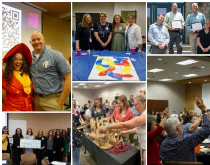
Photos from this year's Academic Innovation Conference

Next year's Academic Innovation Conference will be held June 9th-10th, 2026 at A-B Tech Community College in Asheville. GEAR UP will begin accepting proposals for next year's sessions in October. If you have innovative ideas, research, or experiences to share, GEAR UP invites you to consider submitting a proposal at that time.