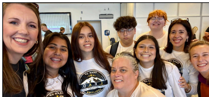
L.E.A.D. students and chaperones pose for a selfie en route to San Francisco for the Youth Leadership Summit