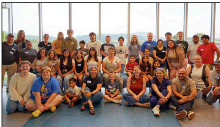
YES Scholar Family Event: End of Summer Celebration

YES wrapped up their summer programming with the end-of-summer celebration on July 31st. Students and their families were encouraged to attend and enjoy dinner with one another while enjoying presentations from YES scholars about their summer adventures.