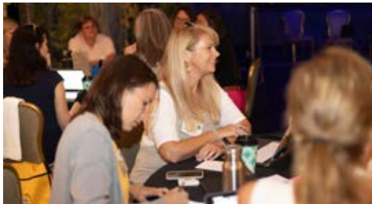
ETL teachers at the Leadership Summit in Asheville, participating in a team building activity.