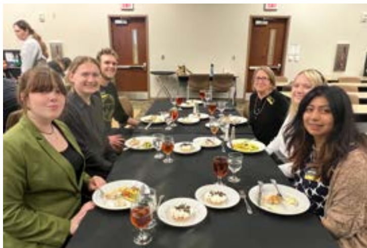
Upward Bound students learning about table etiquette.