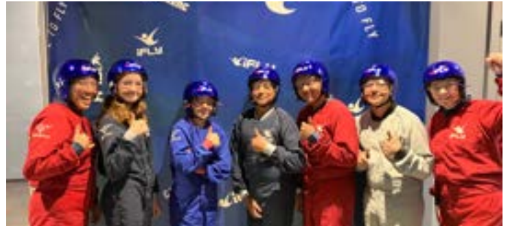
YES students right before they flew in a wind tunnel at iFly in concord, North Carolina.