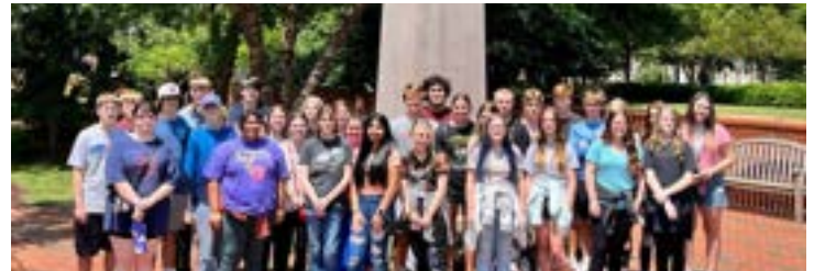
Students visited Wilmington, Charlotte, and Greensboro

"Wow! This library changes everything I thought college might be like! I could live in a place like this."