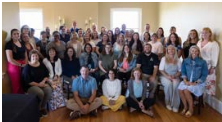
ETL group photo from the ETL School Leadership Summit.

The ETL Teacher Summer Convening is coming up next week! Our team will host 80 teacher participants on campus to network with a group of educators as they begin their self-directed learning journey for the academic year.