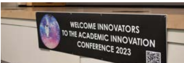
A-B Tech's Conference center from the morning of the first day of the Academic Innovation Conference on June 12th.