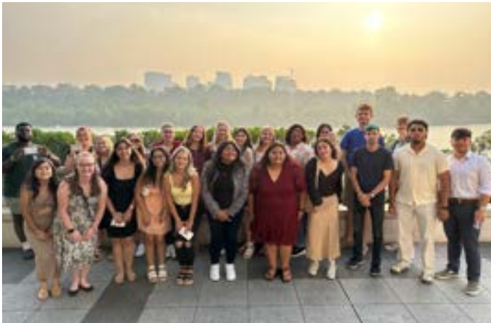
Recent Upward Bound graduates in Washington DC celebrating their successes from this academic year.